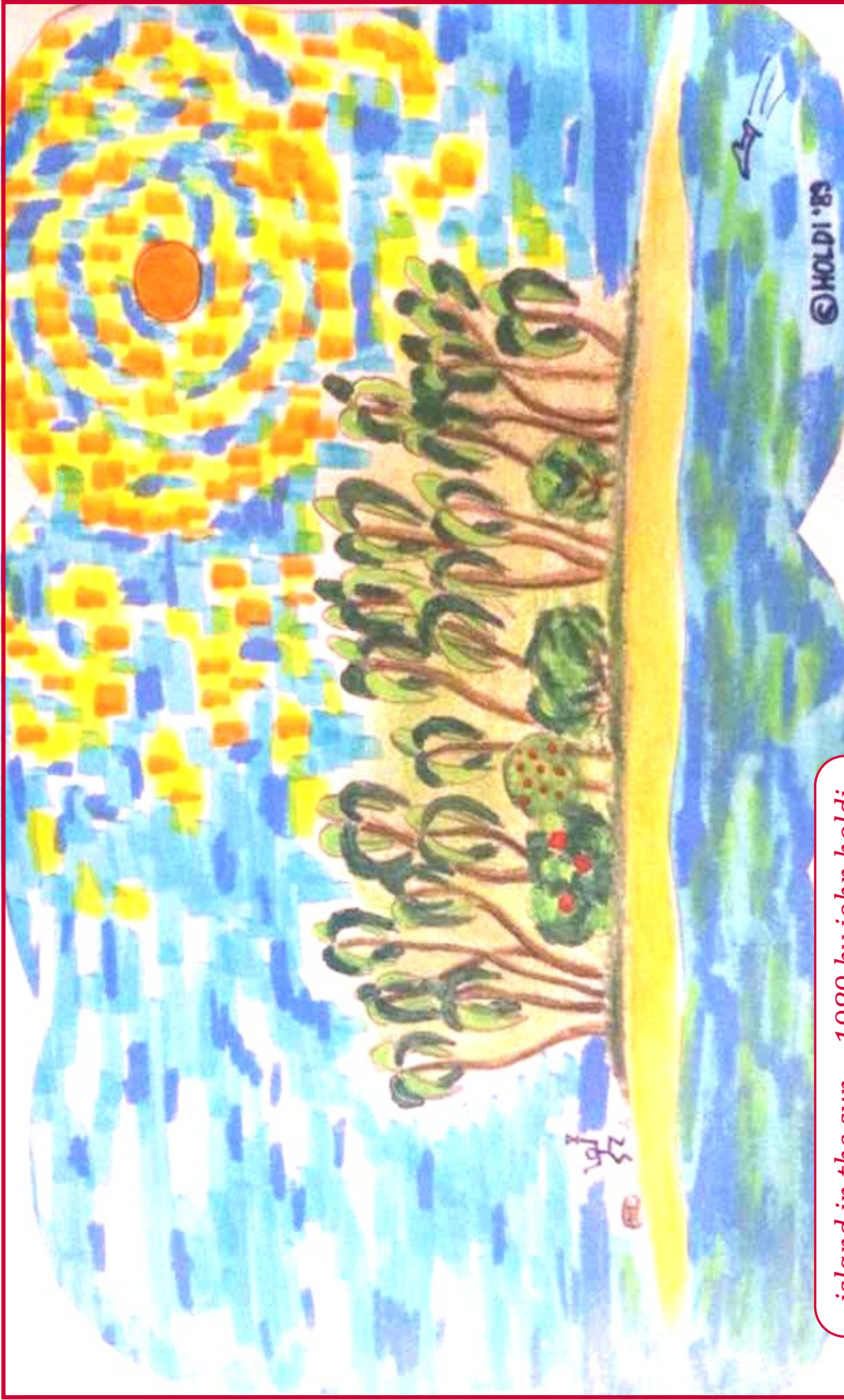
island in the sun—1989 by john holdi

a real masterpiece of contemporary art— created in 1989 AD by john holdi— highlighter and crayon on rose coloured typewriter paper